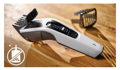
No oil needed, for easy maintenance and to save you time.